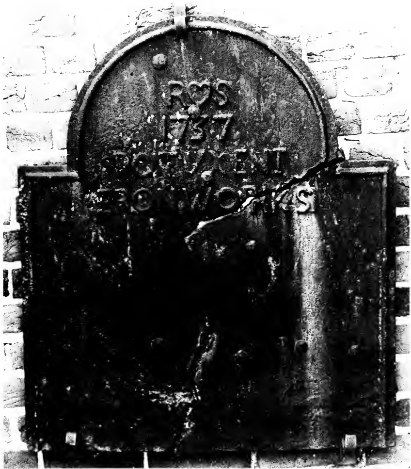
Fireback by the Patuxent Furnace; cast iron; Anne Arundel Co., Md.; 1737. HOA 36"; WOA 30 3 / 8 ".